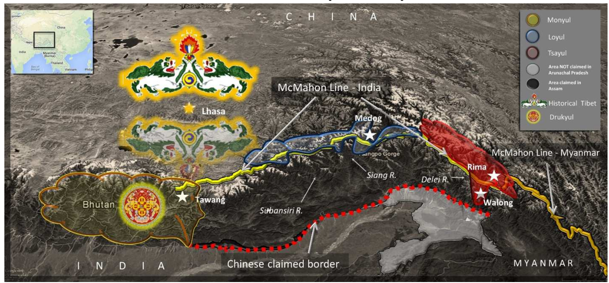
Figure I: Historical 'Monyul', 'Loyul' and 'Tsayul' regions and China's "traditional customary boundary"