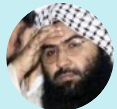
Masood Azhar: Terror Ideologue