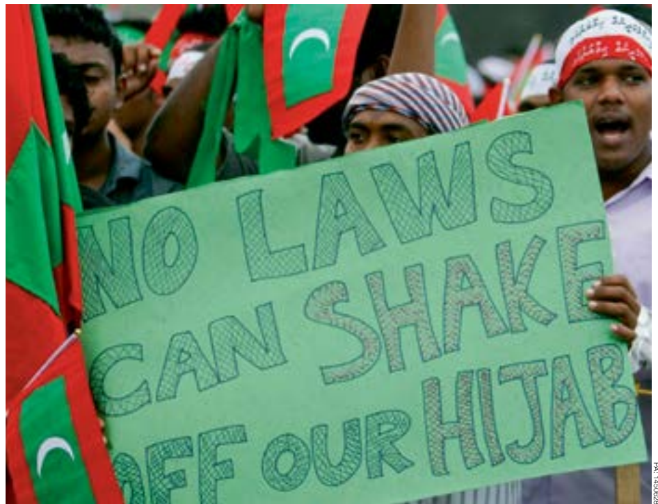
A Maldivian holds a placard during a protest calling on the government to enforce sharia (Islamic law) in Malé, Maldives, on 23 December 2011. Radical Islamists' efforts to implement sharia in the Maldives have occasionally triggered confrontation and violence.

This has come as a shock to the Maldivian government, and to civil society more generally, which have maintained the consistent line that Maldivians are religiously moderate. The Ministry of Islamic Affairs responded to reports of Maldivians fighting in Syria by saying, "No Muslim scholar in the Maldives has called on Maldivians to participate in foreign wars, but there are youths who get emotional from what they see of the suffering of Muslims. There are Maldivian youths who want to avenge that." The radical Maldivian youth who are active on social media sites have two things in common: the desire to implement strict sharia (Islamic law) in the Maldives and a hatred of democracy.